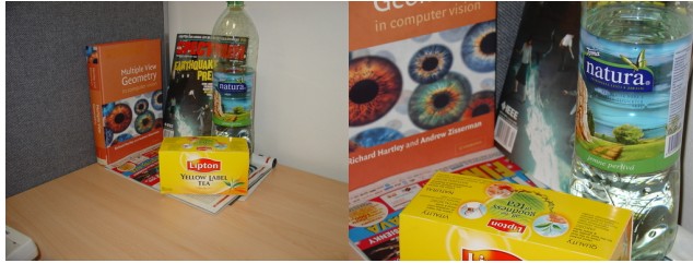
CO - Corner (160 inliers in 626 correspondences)