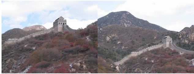
CW - China Wall (106 inliers in 380 correspondences)