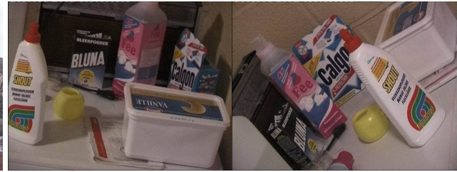
WA - Wash 1 (137 inliers in 591 correspondences)