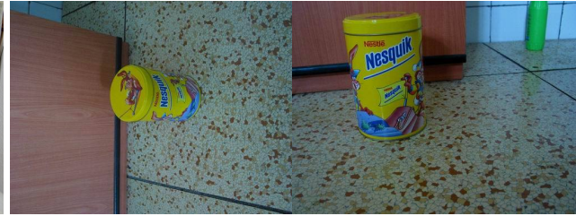
BO - Box (335 inliers in 1472 correspondences)