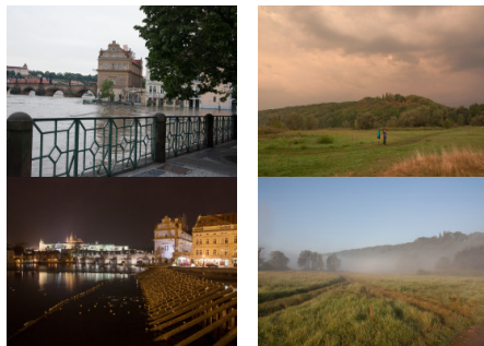
Figure 1: Examples of WxBS problems.

Orientation and viewpoint "baselines" are not the only factors influencing the complexity of establishing geometric correspondence between a pair of images. The standard physical models of image formation and acquisition consider the effects of illumination, the properties of the transparent medium light rays pass through in the scene, surface properties of objects and properties of the imaging sensors.